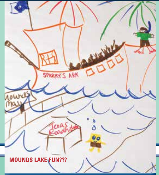
MOUNDS LAKE FUN???