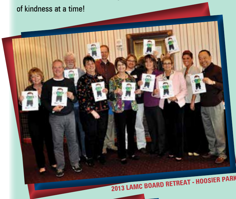
2013 LAMC BOARD RETREAT - HOOSIER PARK

Check out FACEBOOK and see what is happening... Our LAMC and YLA Alumni are taking LEADER MADDY with them on vacations, mission trips and social events... You will see LEADER MADDY serving others around the world. Please print off LEADER MADDY from page 7 and let us know where you are and what your service is to others. Making a difference one act of kindness at a time!