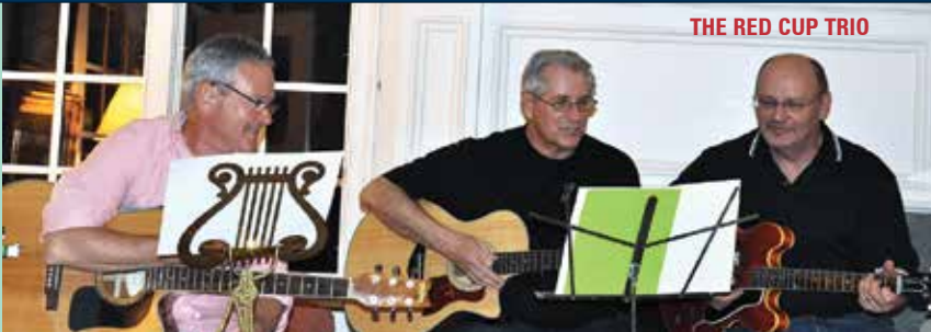
THE RED CUP TRIO